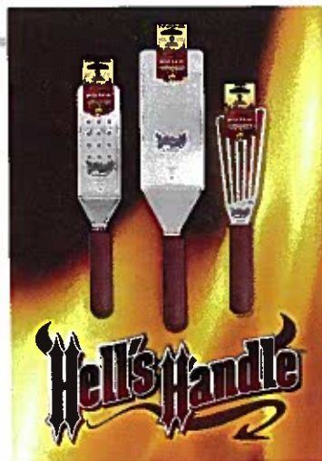
Mercer Cutlery, Div. Mercer Tool Corp.

Mercer Cutlery, Div. Mercer Tool Corp. Hell's Handle heat-resistant turners feature stainless-steel blades. The NSF-certified turners withstand temperatures up to 450°F., according to the maker. www.mercercutlery.com , NAFEM Booth #2102