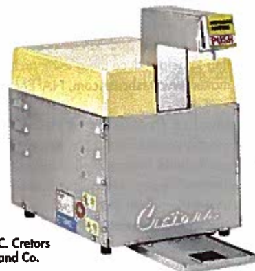
C. Cretors and Co.

C. Cretors and Co. This liquid topping dispenser accommodates one 2½-gal. bag of topping for bag-in-box use and can be configured with a 2-gal. liner for pour-in applications. www.cretors.com , NAFEM Booth #1371