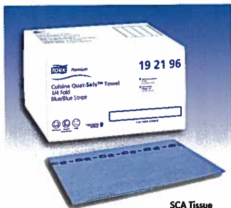
SCA Tissue North America

SCA Tissue North America The Premium Cloth with Quat-Safe™ reduces the risk of contamination, according to the maker. The cloth is available in two colors: one for kitchen and back-of-the-house use and one for public areas such as bars and counters. www.torkusa.com